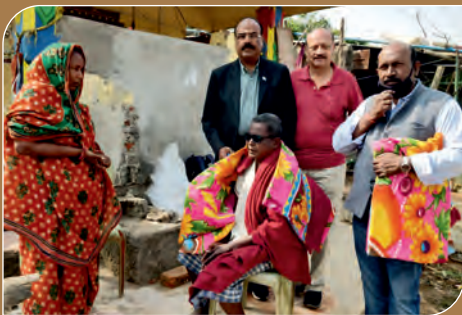
Blanket Distribution, RC BBS Capital & BBS Excellence