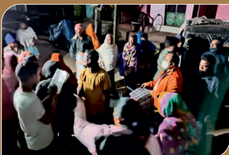
Blanket Distribution, RC Berhampur