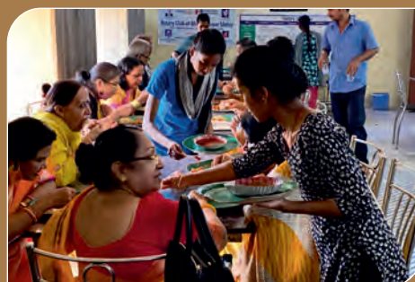
Observing Annapurna Day, RC BBS Metro