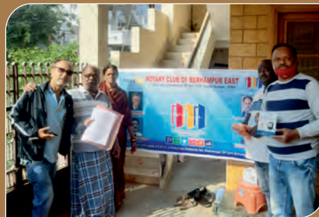
Personal Health Check-up of Rotarians, RC Berhampur East