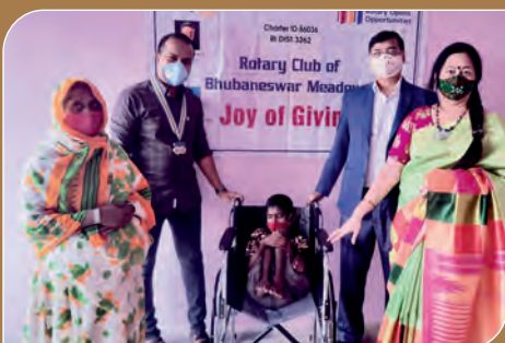
Joy of Giving, RC BBS Meadows