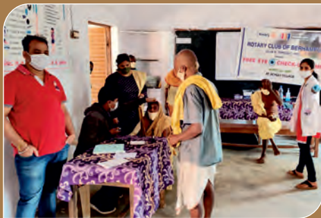
Free Eye Check-up Camp, RC Berhampur