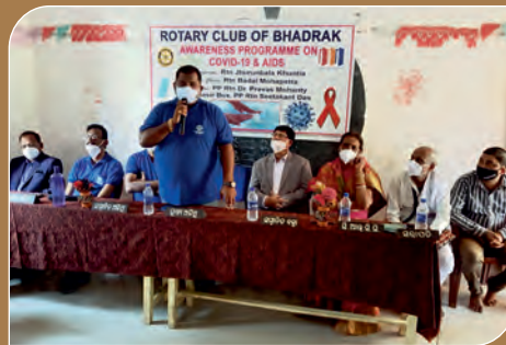
Covid Awareness Programme, RC Bhadrak