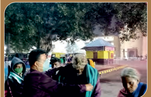
Blanket distribution, RC CTC Barabati