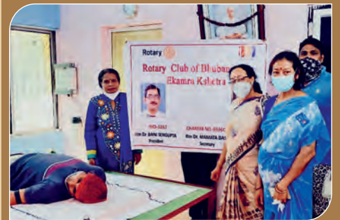
Blood Donation Camp, RC BBS Ekamra Kshetra