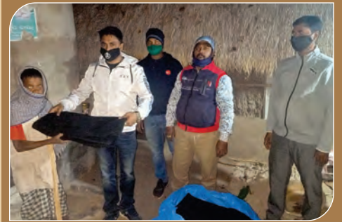
Distribution of Blanket, RC Balasore Central