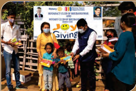
Joy of Giving, RC Bhubaneswar