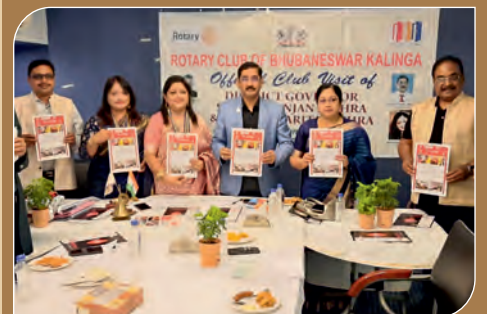
Official Club Visit, RC BBS Kalinga