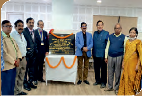
Official Club Visit and Blanket Distribution, RC Cuttack