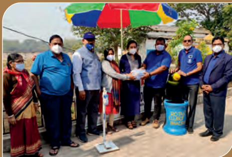
Donation of dustbin, umbrella, mask, sanitizer, RC Bhadrak