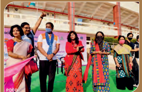
Minister at All Women Car Rally, E-Club of District 3262