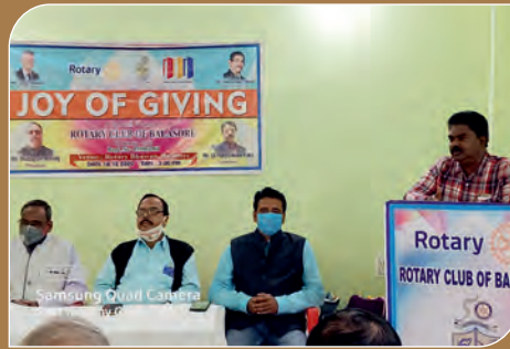
Joy of Giving Ceremony, RC Balasore