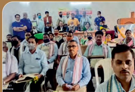
Nation Builder Award, RC BBS Capital