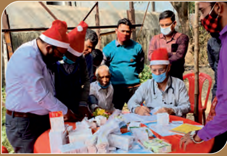
Health Check-up Camp and Clothes Distribution on Christmas Day, RC CTC Golden Star