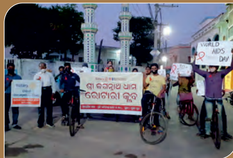
Awareness Campaign on World Aids Day, RC Sree Jagannath Dham