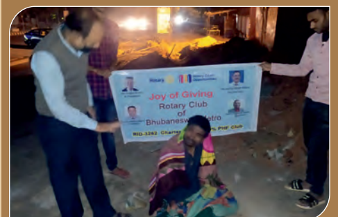
Distribution of Blanket, RC BBS Metro