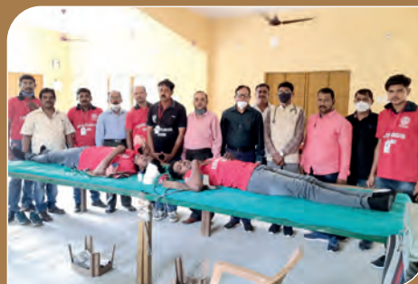
Blood Donation Camp, RC Choudwar