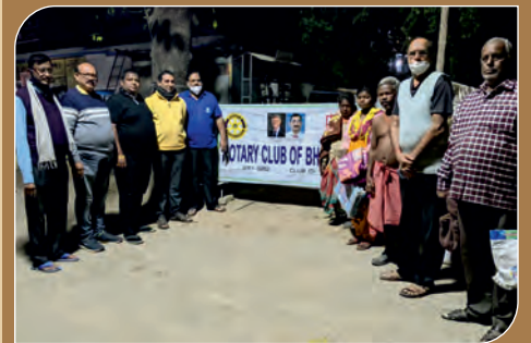
Blanket Distribution, RC Bhadrak