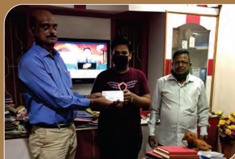
Financial support to a poor student, RC Cuttack Midtown