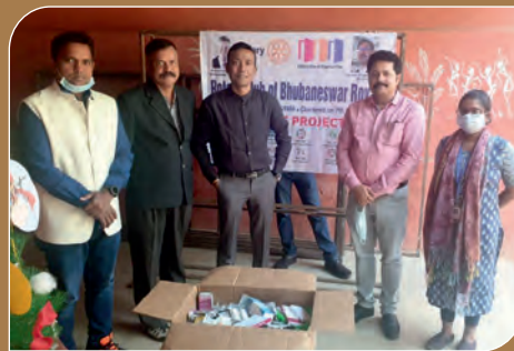
Medicine Distribution, RC BBS Royal