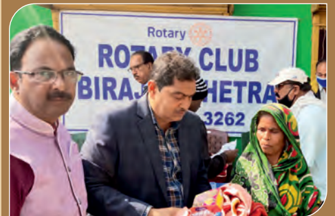
Blanket Distribution, RC Biraja Khetra