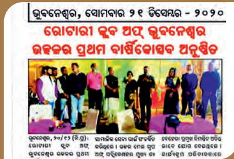
Celebration of 1st Charter Day, RC BBS Utkal