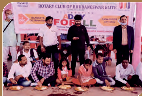
Observing Annapurna Day, RC BBS Elite