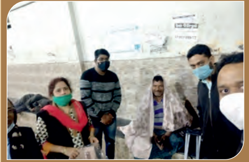
Distribution of Woolen Shawl, RC CTC Mahanadi