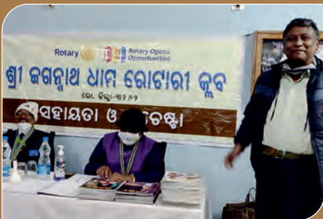
Talk on Positive Health, RC Sree Jagannath Dham