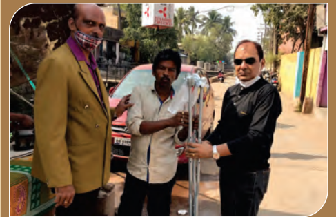
Helping to differently abled, RC Cuttack Midtown