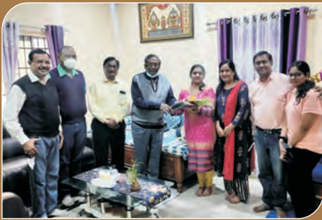
RC Angul Royal