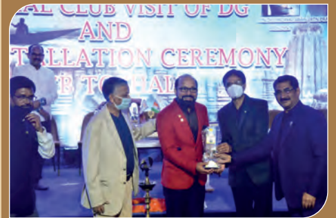
Official Club Visit, RC BBS Toshali