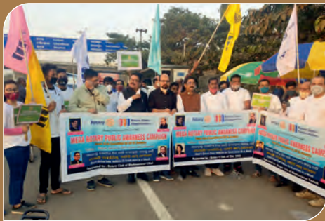
Public Awareness Campaign, RC BBS Utkal