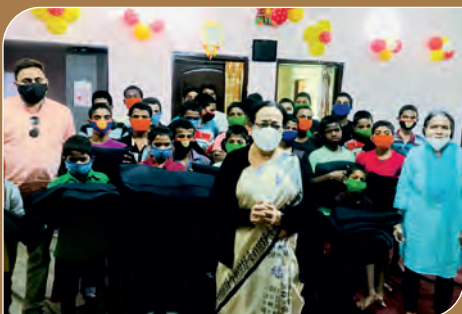
Blanket Distribution, RC BBS Ekamra Kshetra