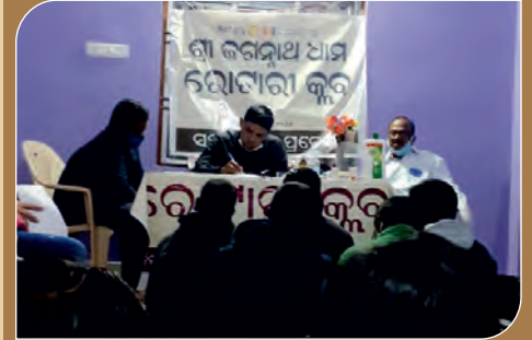
Free Health Check-up Camp, RC Sree Jagannath Dham