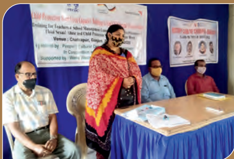
Workshop of Teachers and school committee, RC Chhatrapur-Ganjam