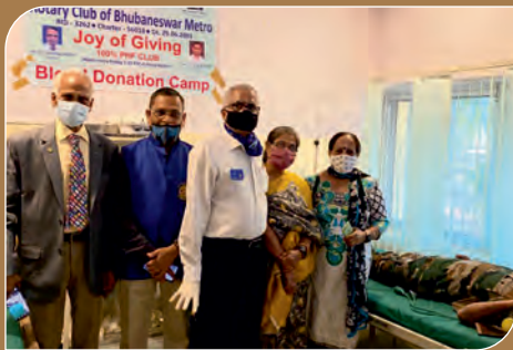
Blood Donation Camp, RC BBS Metro